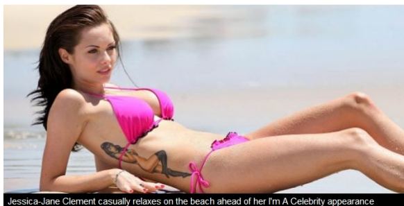
Jessica-Jane Clement casually relaxes on the beach ahead of her I'm A Celebrity appearance

Jungle hotty Jessica Jane Clement splashed out £1000 on a makeover to keep pretty during I'm a Celebrity...Get Me Out of Here.