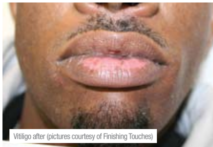
Vitiligo after