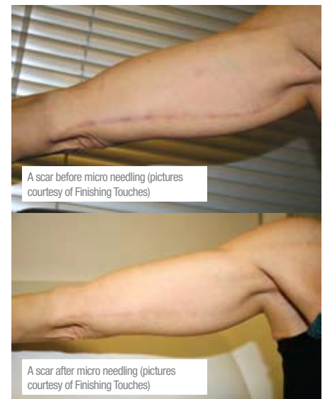
A scar before micro needling

Although the treatment can also be used to re-introduce pigment to scars from accidents and burns, it can also be used, in the same way as dermal rolling, to encourage collagen production and help promote healing in scars. In this instance the same equipment/needles are used just without pigment - known as 'dry needling'. The process of injuring the skin with the needle promotes a wound healing response, encouraging collagen and melanin production and relaxing contractures, and thus the appearance of scars can be improved. Sam says, "The result leaves the scar looking flatter softer and less rigid. This simple and cost effective technique has produced amazing success where many other creams, patches and surgeries have failed."