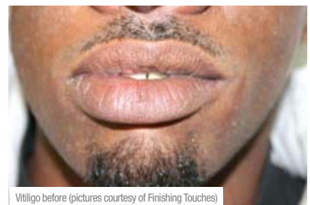
Vitiligo before

feel like they belong to themselves. All I am doing is putting the colour back in but I get all the tears and the emotions coming out because they look at themselves and feel they are back to normal. This is the type of work that allows you to give something back."