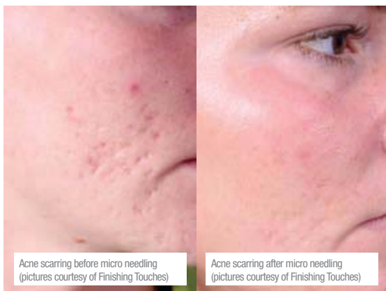
Acne scarring before micro needling

The medical applications for the treatment are plentiful and include areola tattooing following mastectomy (perhaps the most popular) as well as eyebrow/eyelash reconstruction for alopecia patients who have lost hair through burns,